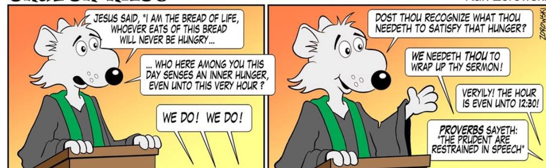
Copyright 2021 Karl A. Zorowski. All rights reserved. Used with permission. Visit us online at www.churchmice.net.