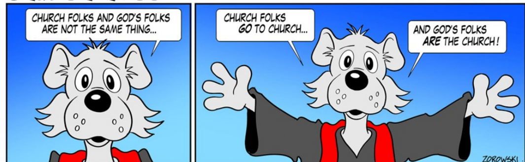
Copyright 2024 Karl A. Zorowski. All rights reserved. Used with permission. Visit us online at www.churchmice.net.